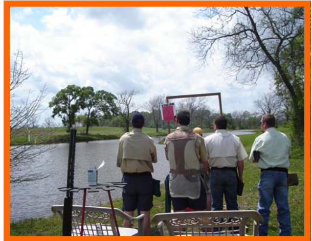
Beautiful Rio Brazos Sporting Clays course

All Scorecards in by 4:30pm $5 LUNCH 11:30-2:00