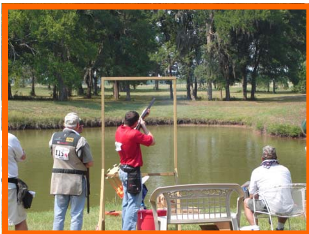
Houston 's most beautiful Sporting Clay Venue!

All Scorecards in by 4:30pm $5 LUNCH 11:30-2:00