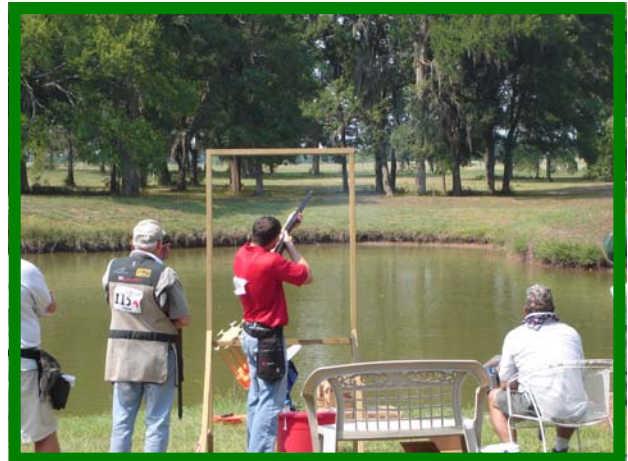
Rio Brazos ' beautiful courses