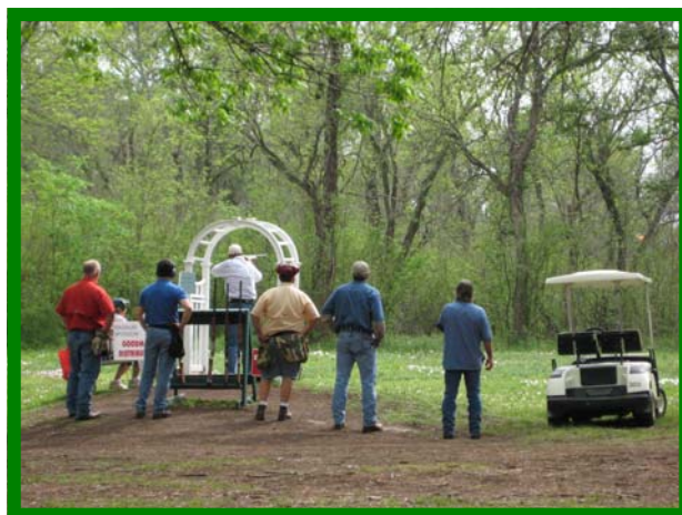
Rio Brazos ' beautiful courses

Winners: Main Event has 3 lewis classes Prizes are: Free Rounds HOA of 200 total wins 2010 Annual Clay Pass